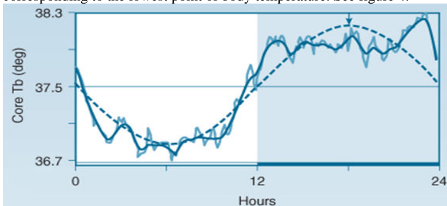
Figure 4 - The 24-hour circadian rhythm in body temperature (taken from Kryger, Roth, and Dement, 2005).

Human beings are diurnal in nature which means that we follow a natural rhythm of being awake during the day and asleep at night. This natural circadian rhythm is about 24 hours in duration and is primarily set by the brain's response to light exposure. In addition to sleep propensity, circadian rhythm also modulates core body temperature and neurobiological performance in a sine-wave shaped pattern (Kryger, Roth, and Dement, 2005). All three of these parameters are interrelated such that when our body temperature decreases our sleep propensity will increase. This results in the highest period for sleep propensity between 0400 hrs and 0600 hrs corresponding to the lowest point of body temperature. See figure 4.